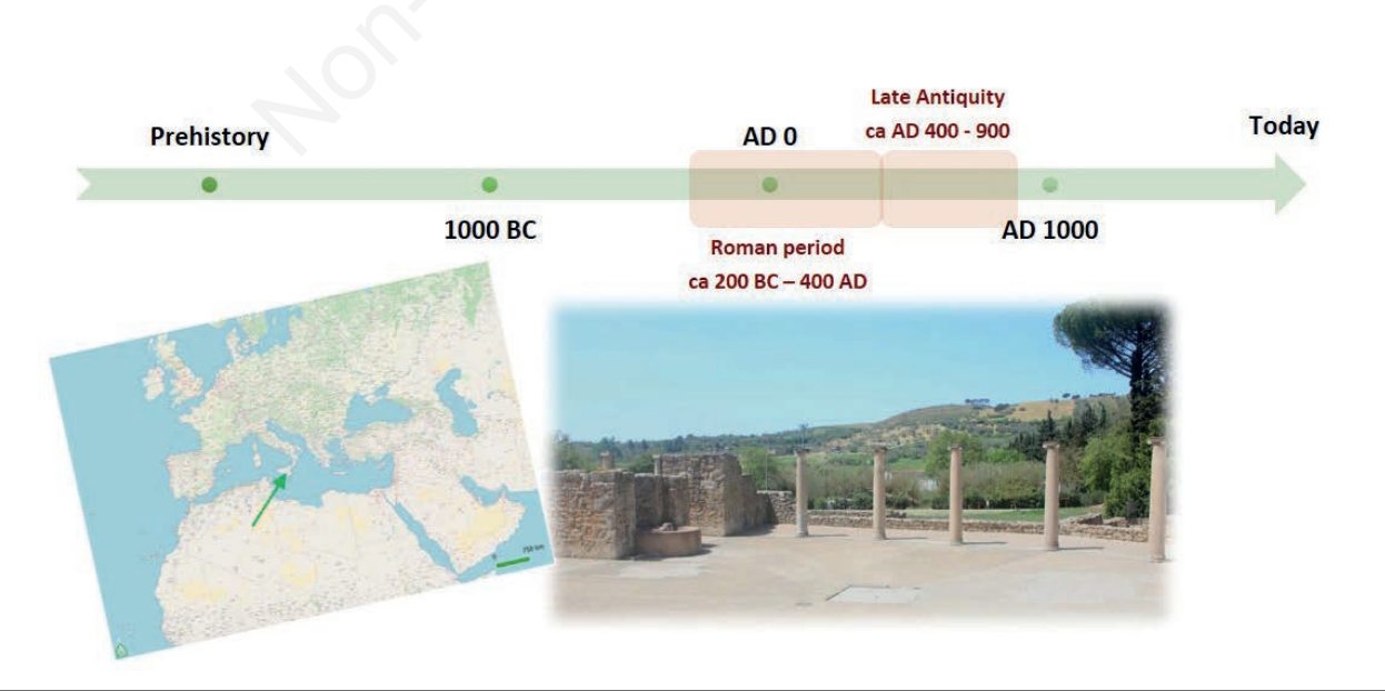
Figure 1. Timeline with chronology of the Roman period and late Antiquity in Sicily.

Once we zoom into the Roman period, we zoom out and back to current management practices. To reconstruct the ecology of olive agrosystems today we compiled data co-produced with locals and collected within the EU LIFE project Olive4Climate. We looked at present-day correlations between the diversity of man-