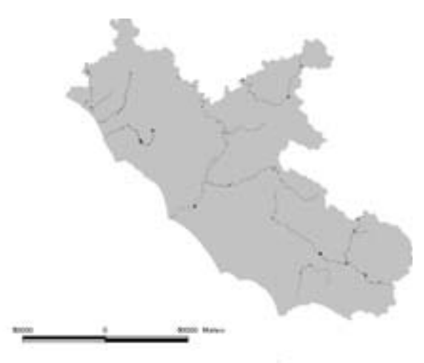
Figure 2. Locations of monitoring stations.

of the landscape is more suitable to detect the relation between landscape and environmental quality of the water body, both buffers were analysed with the Level 1 and 3 of CLC.