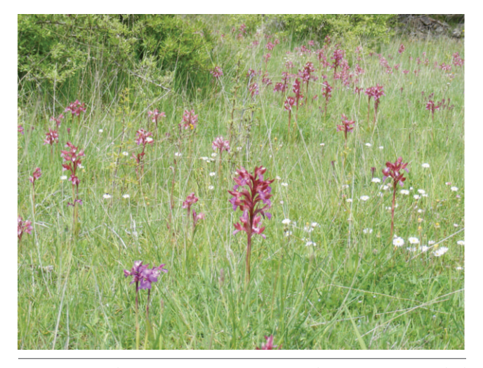
Figure 3. Habitat 6210*Festuco-Brometalia important orchid sites (M. Serranetta, Appennino Lucano, PZ, Italy.).

It results to be of primary importance to fill in the informative gap related to the meadow- grazing sector, achieving complete inventories not only based upon the knowledge of the resource dimension (surfaces, kinds of information, productivity, quali-quantitative indexes), but also on the ecological (biodiversity, grade of naturalness, fluxes of