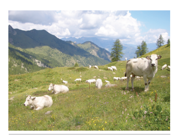
Figure 2. The maintenance of natural pastures with rational criteria (Alpe Valanghe, Val Maira, CN, Italy. Courtesy of M. Verona).