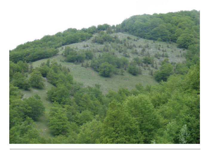
Figure 1. Reduction of the area occupied by open habitats: progressive closing (M. Arioso-Appennino Lucano, PZ, Italy.).

The areas dominated by herbaceous vegetation represent important pieces of the landscape and, together with other kinds of soil use, give heterogeneity and variability to the environment, making it less monotonous thanks to the alternation of open-spaces and wooden, closed and less accessible areas, above all at low altitude. This wealth of environments is a variability of habitat for wildlifeand for spontaneous flora, which further increases the biological diversity of the territory